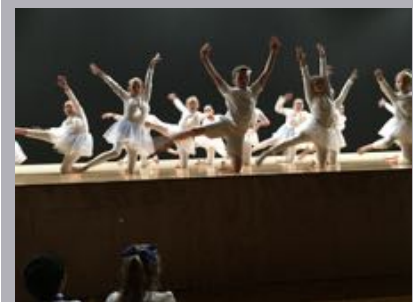
The "Clouds" performing at Devonport Festival

Friday 25 September 3pm Last day of term