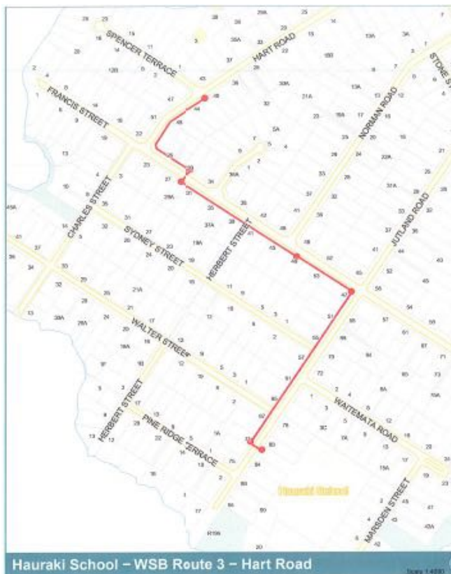
Hart Rd route