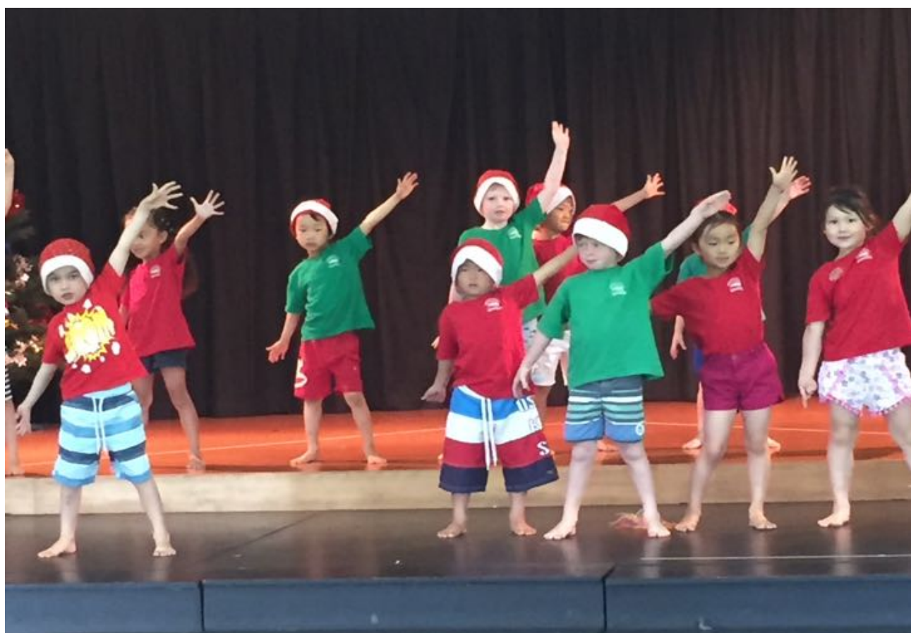
Dress Rehearsal for the Junior Xmas Concert

Thank you for your on going support during the year. As this is my last newsletter for 2015 I wish you all a peaceful Christmas and happy summer holiday!