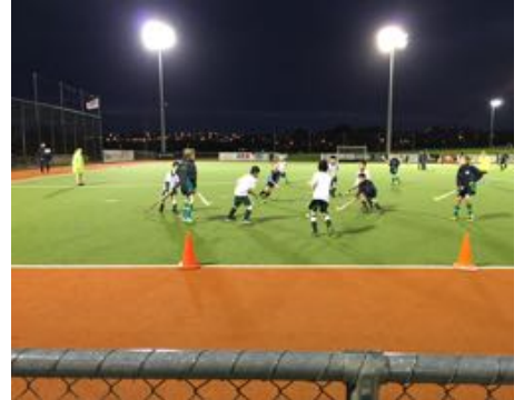
Senior boys hockey team playing at North Harbour on Monday night.