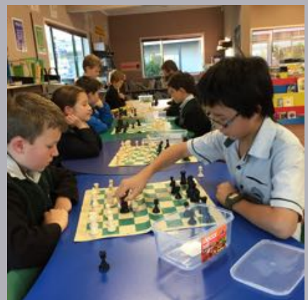
Chess on Wednesday mornings at 8am!

Tuesday 11 August Sports and cultural photos