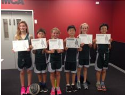
Hauraki Rockets at their award ceremony.

Hauraki Magics 2 nd in their grade Hauraki Rockets 2 nd in their grade Hauraki Flames 4 th in their grade