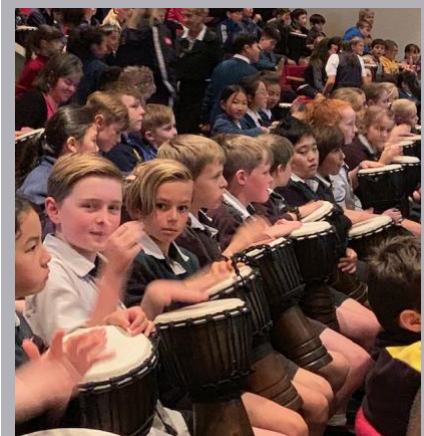
Year 6 Captains enjoying Leadership Day at Kristen School