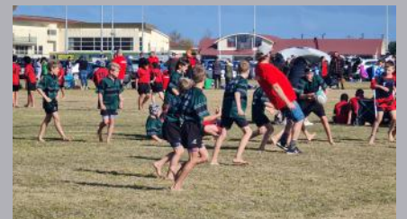
Barbarians rugby field day