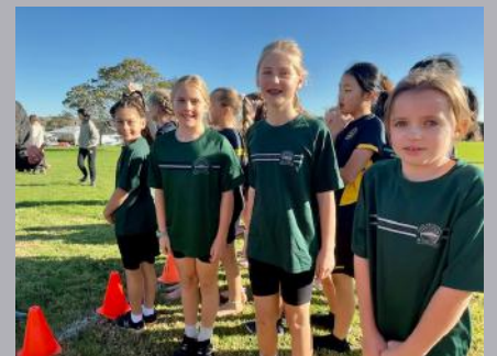
Inter-school cross country