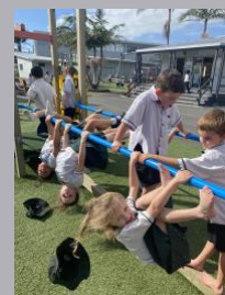
Lunch time play