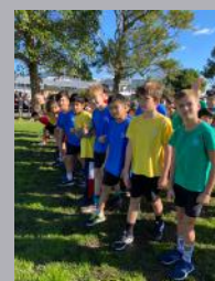
Year 6 boys on the start line