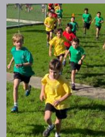
Year 4 boys

Wednesday 7 June Inter-school Cross Country