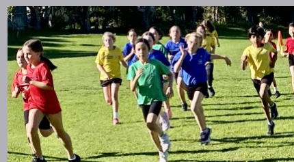
Cross Country: Year 5 boys and girls