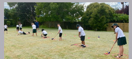
Snag golf lessons

Thursday 9 March 3.10-8.30pm Parent Interviews