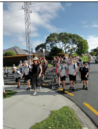
Walking Bus walk