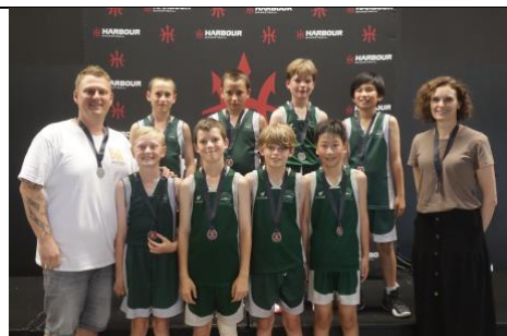
Cobras with their silver medals.