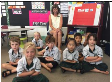
Brand new 5 year olds in room 1