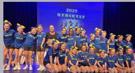
Jump Jam team