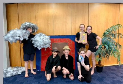
Tournament of Minds team