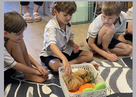
Some animals came to visit that were greatly adored by Year 2 students

Monday 1 June King's Birthday – school closed