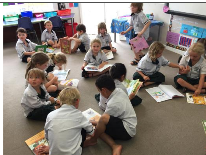
Room 1 enjoying reading time