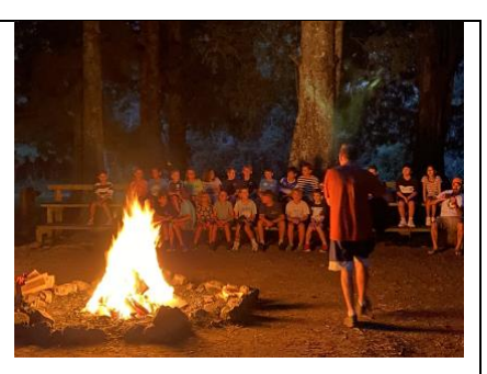
Sing song round the camp fire