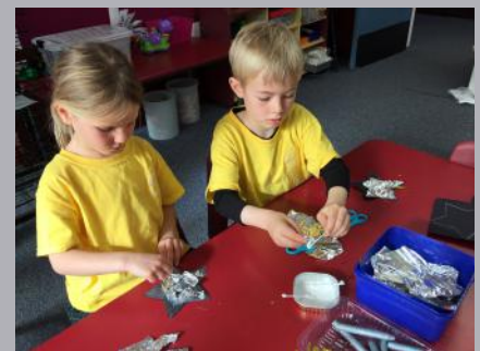
Juniors celebrating Matariki!