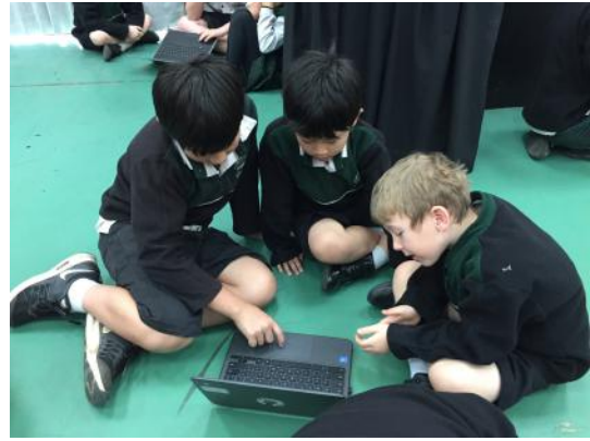
Maori language Week: Year 6 students sharing their mihi with junior tamariki