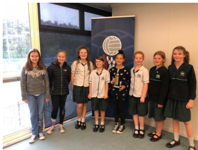
Winning Golden Ferns

Hauraki Falcons v Pinehill Grizzlies 15:0 (win)