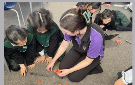
Year 6's coding using robots

House Captains to attend Leaders Day at Kristin School