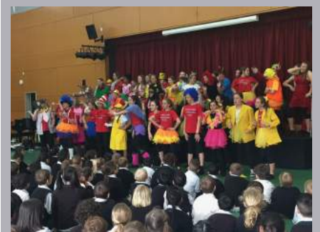
Takapuna Grammar entertaining our students with a taste of Sessal

End of term 4. School closes for the year.