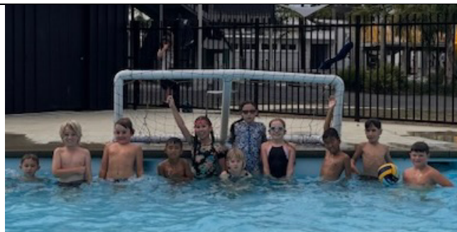
Hauraki Dolphins above had a successful weekend with two straight wins (both 6:0) in their grading games.