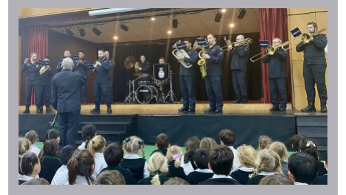
Navy Band playing at a school assembly last week

Friday 22 September 8.30am Parents invited to view and share children's learning