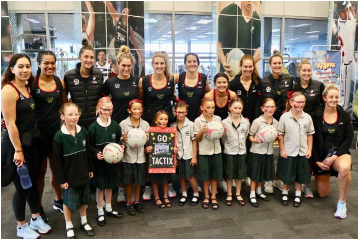
Hauraki 4/1 enjoyed attending Mainland Tactics netball teams training session last week

Hauraki 6/1 v Marist 30-7 win Hauraki Y5 Potters v Pt Chevalier 23-1 win Hauraki W4 v Pt. Chevalier 11-6 win