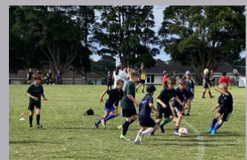
Recent football field day at Bayswater Park