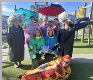
Junior teachers dressed as Better the Wetter and Hot Dog!