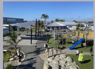
Lunch time play in the playground

Sunday 1 December 2pm Children's movie screening