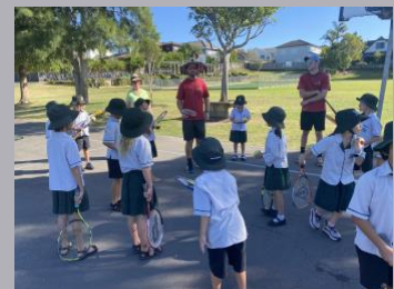
Tennis lessons for PE this week

Last day of term 1 – please note this is no longer a teacher only day as previously advertised