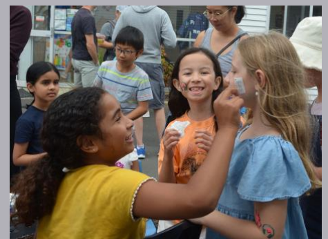
Electric Picnic Fun

82 Jutland Road, Hauraki, Auckland 0622 Phone: 09 489 4568 | Fax: 09 489 4579 Email: office@hauraki.school.nz