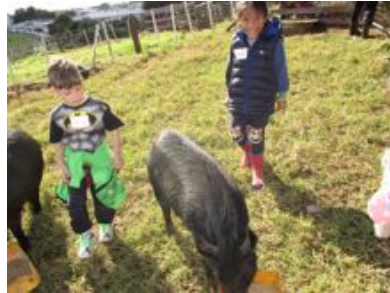
Junior School visiting the farm this week