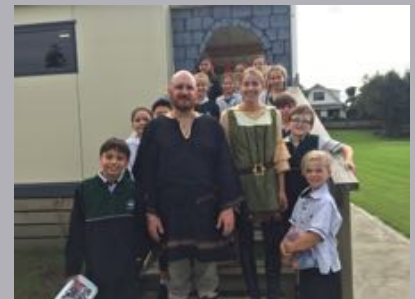
Teachers enthusiastic about medieval times!

Friday 8 June 9-10.45am Open Day for prospective parents