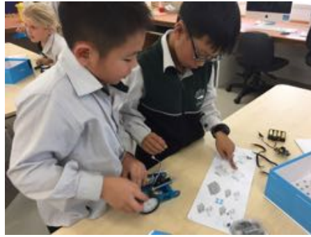
Robotic construction by year 4 students