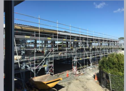
Rear view of our new building