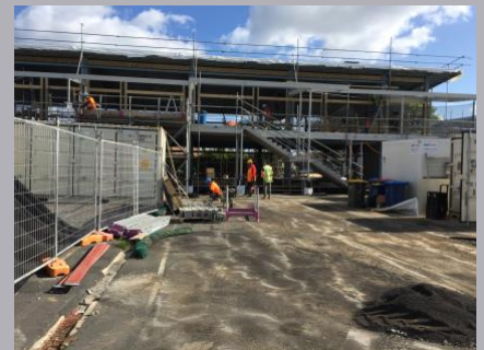
Front view of new building

C3 Construction has been back on the job during the past week and are working hard to catch up lost time. They continue to make good progress but the completion date has been postponed till December.